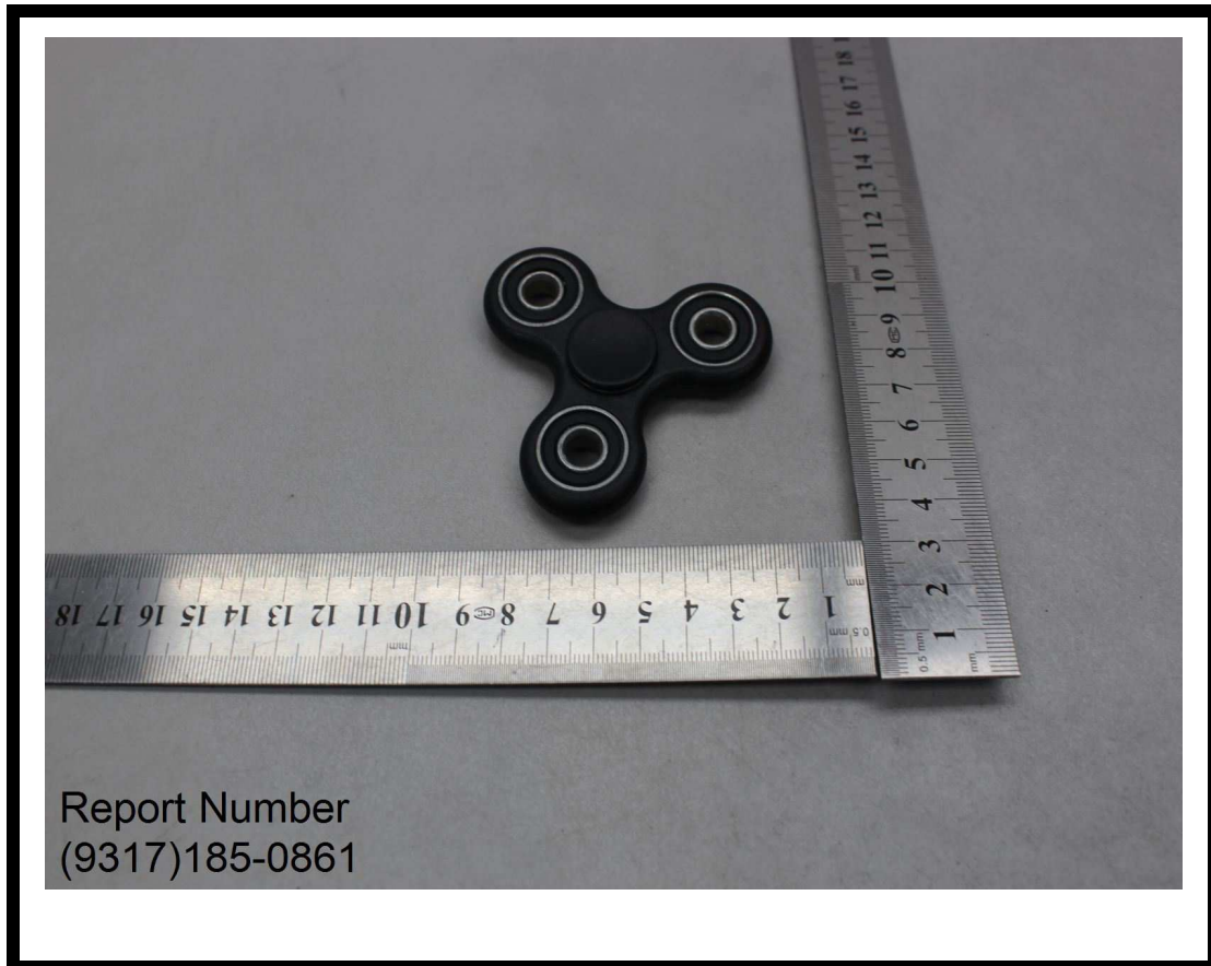
Photo of the Submitted Sample